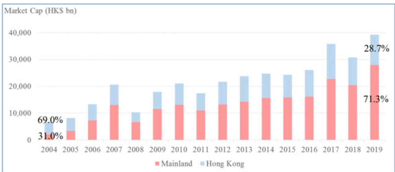
Graph 2: Market Capitalisation by Geographical Classification (2004-2019)